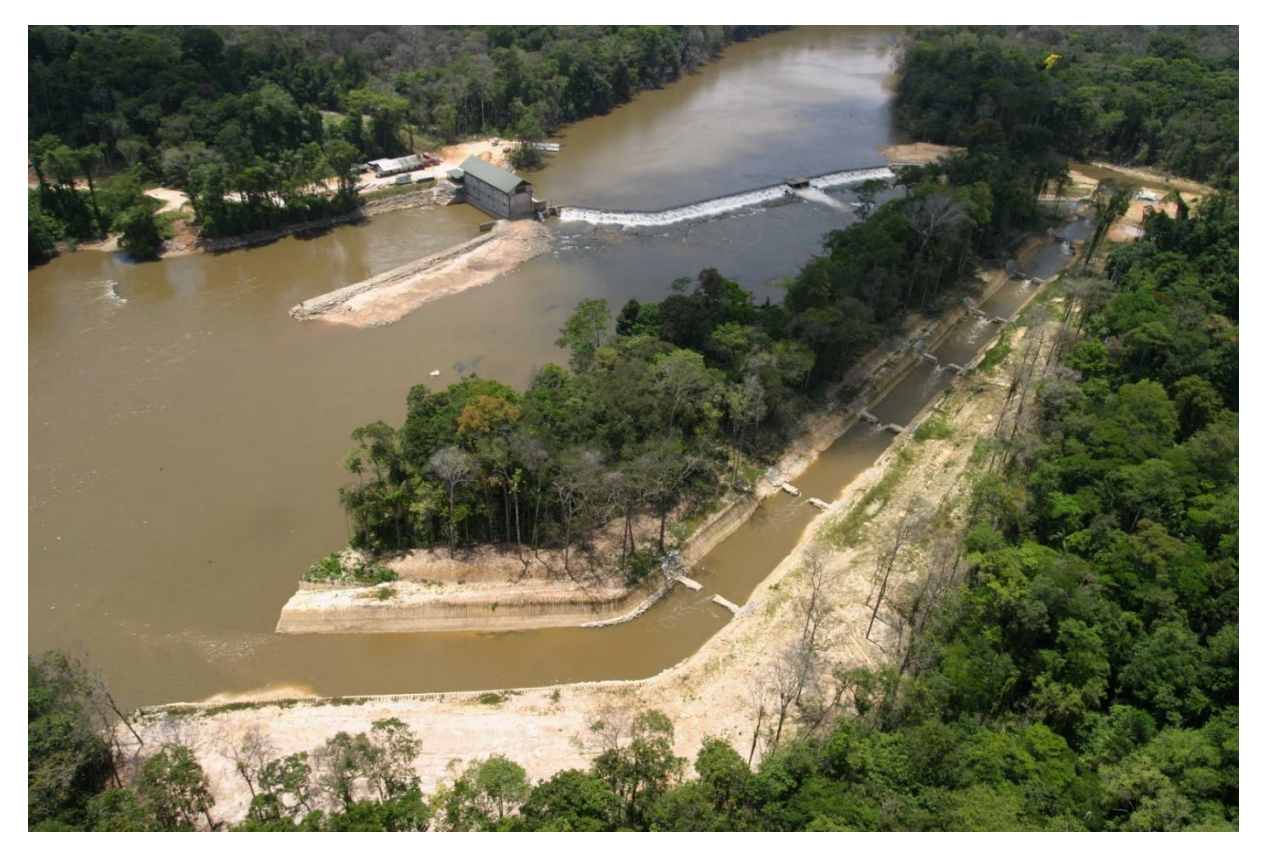
A Voltalia hydropower plant in French Guiana

They are typically more complex than solar or wind projects and require more permits and longer planning and realization processes. The lifetime of a hydropower plant goes far beyond the lifetime of a solar or wind power plant. Their average life span is somewhere from 50 to 100 years.