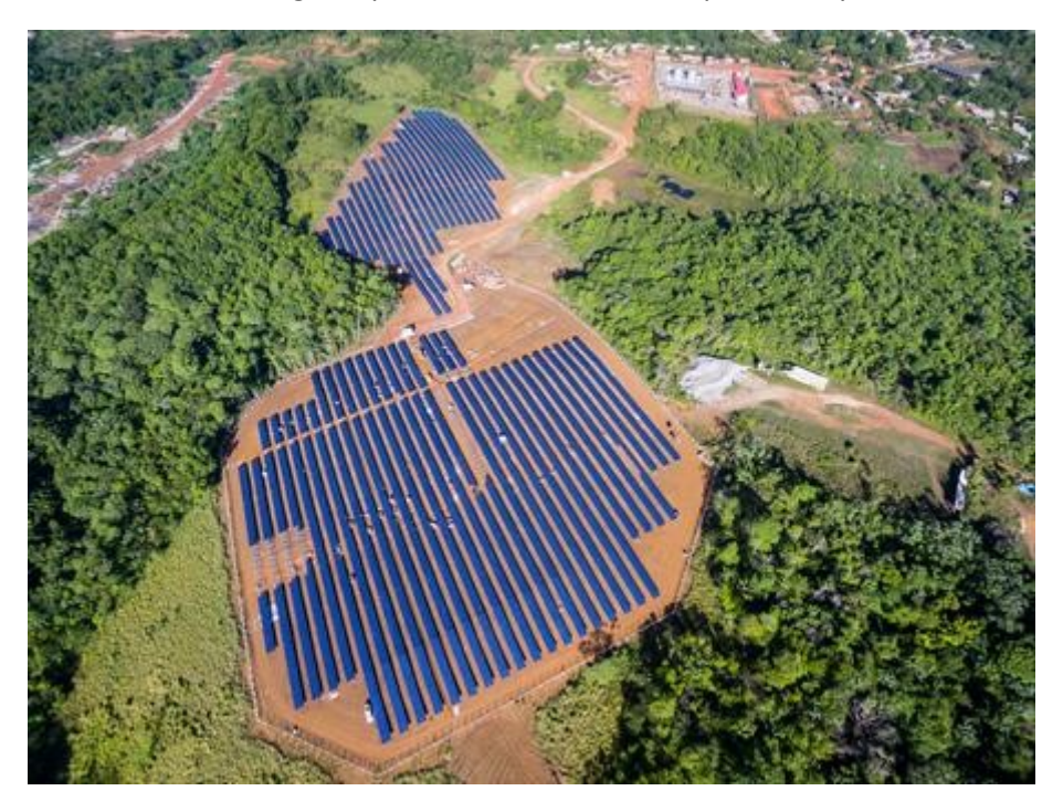
Voltalia added a 4 MW solar power plant to diesel gensets in Oiapoque in Brazil

For many renewable energy companies, mining is one of the most attractive segments of hybrid and microgrids markets. This is because mining provides the potential for realizing large-scale solar or wind power plants and because mining companies are considered as particularly reliable off-takers.