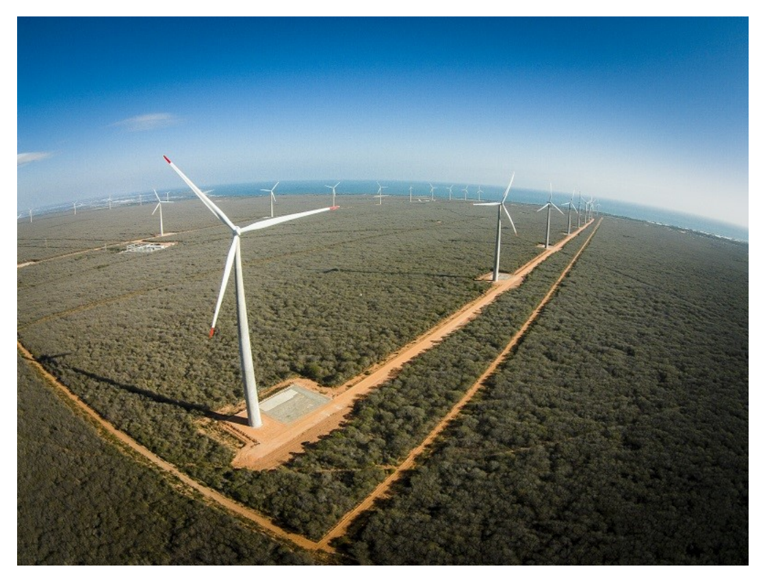
Voltalia wind park in Serra do Mel, Rio Grande do Norte, Brazil

The largest renewable energy system to date that has been built on-site at a mine is a 15 MW solar plant. Much bigger solar and wind power plants have been realized for grid-connected applications. In addition to the collapse of key component costs, the world's leading renewable energy companies have realized additional cost savings potential by optimizing the design and construction processes in large-scale projects.