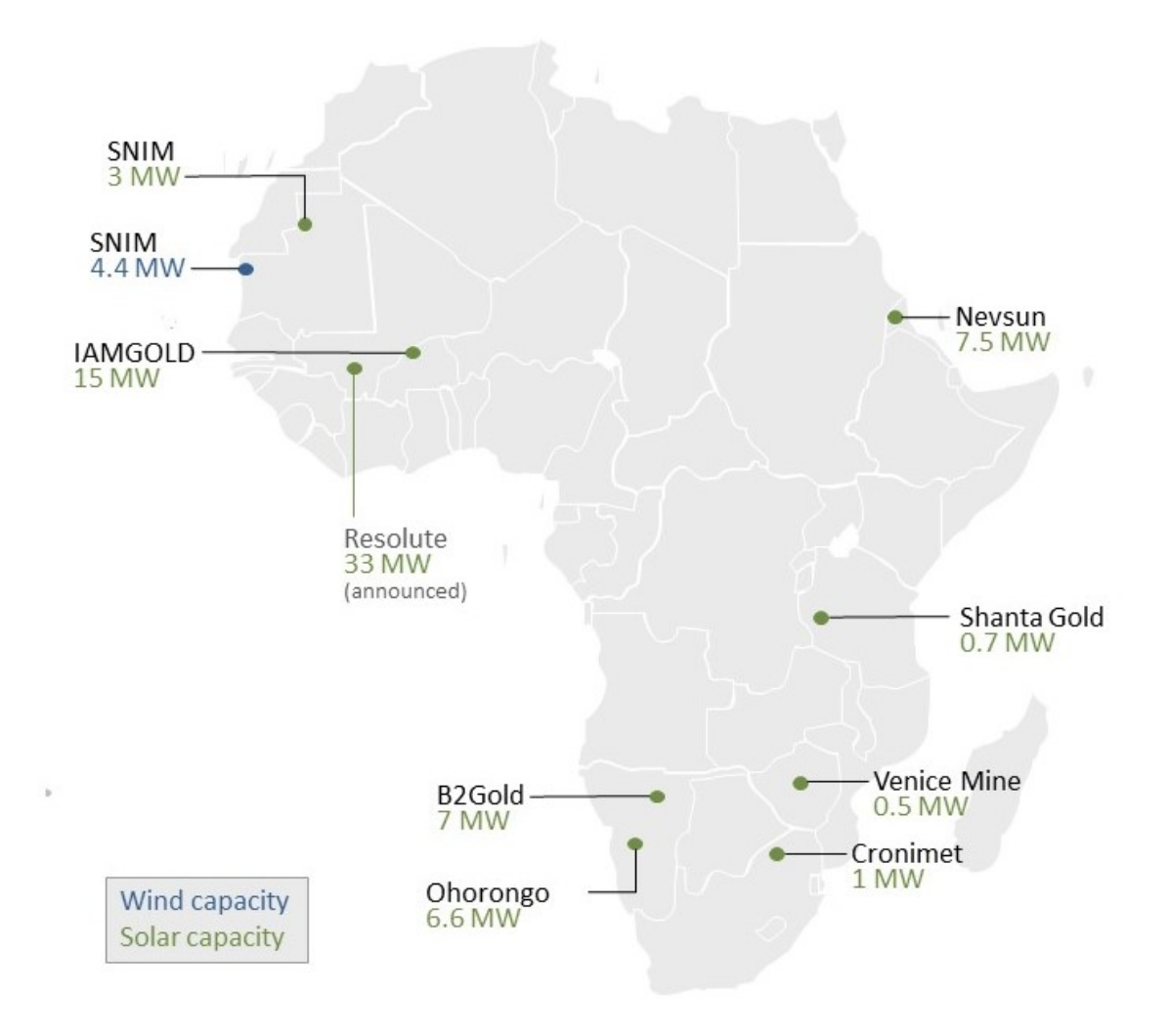
Realized and announced on-site renewable energy projects for mines in Africa including cement

In the past, renewable energy was only economically applicable to a rather limited number of mines. Significant cost saving potential existed only for remote mining locations with particularly high energy costs due to the transport of the fuel. This has changed fundamentally since the costs for solar and wind power collapsed a couple of years ago. As a result, solar and wind are currently the cheapest source of energy almost anywhere in the world, allowing for energy cost reductions at numerous mines.